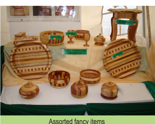
Assorted fancy items

Available products include: farm sawing and forest harvesting technologies, timber treatment and drying services, assorted timber and non-timber products, that links well to industry and small medium enterprises.