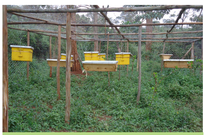
Beekeepng is one of the resource based activity that the community group aims to tap and enhance forest management