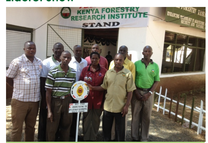
KEFRI staff holding a ranking board for attaining 2nd position for demonstrating application of EMS at Eldoret show